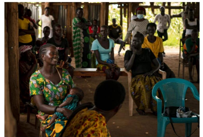
Refugees in South Sudan gather.

In this year of unprecedented wildfires from coast to coast, PWRDF is establishing a fund specifically for in-Canada emergency response.