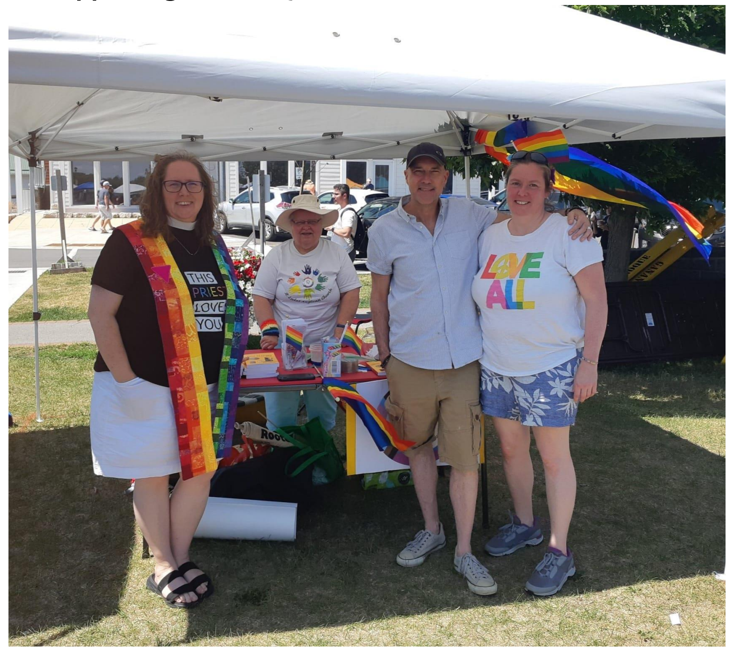
Gananoque Pride 2023